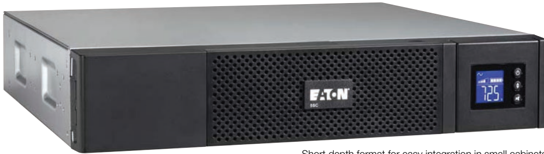
Short depth format for easy integration in small cabinets