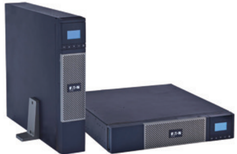
2U rackmount/tower: 1440–3000 VA