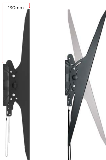
Tilts up to \pm 15^\circ