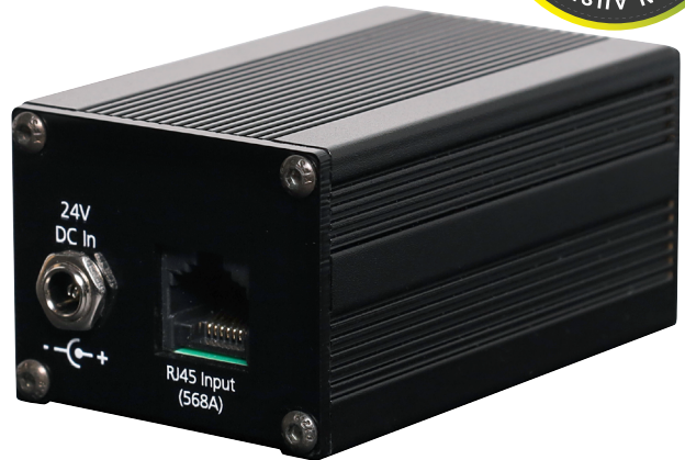
Redback® A 4658 (Rear)