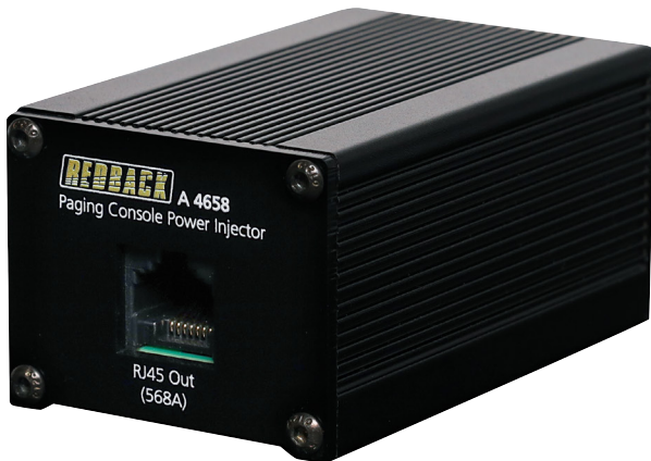
Redback® A 4658 (Front)