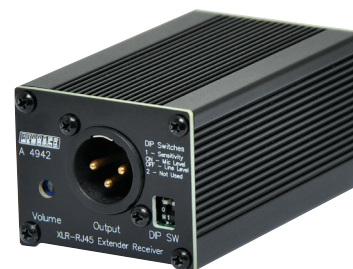
Fig 1. Redback® A 4942 Receiver (Front)

Failure to follow the correct wiring configuration may result in damage to system components.