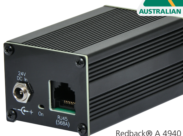
Redback® A 4940 (Rear)