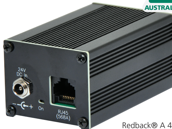
Redback® A 4942 (Rear)