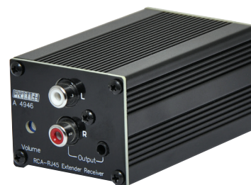
Fig 2. Redback® A 4946 Receiver (Front)

Failure to follow the correct wiring configuration may result in damage to system components.