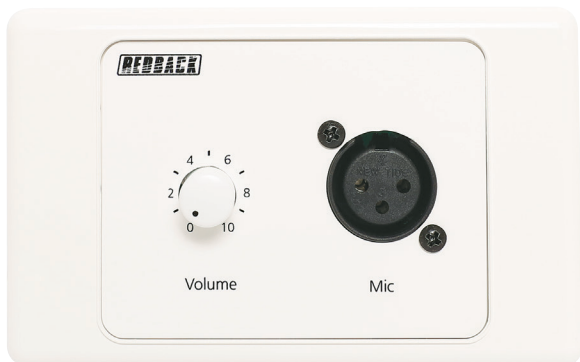
Redback® A 4941 (Front)