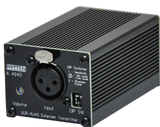
Fig 1. Redback® A 4940 Transmitter (Front)

The Redback® A 4946 can be connected to compatible Redback® products such as the A 4940 and A 4944. These products have either a 3 pin XLR (A 4940) or Dual RCA (A 4944) input and transmit this audio down the Cat5/6 connection to the Redback® 4946.