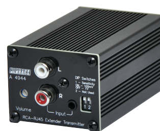
Fig 2. Redback® A 4944 Transmitter (Front)