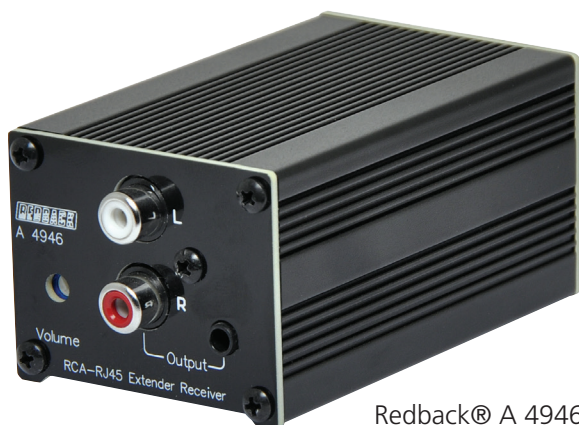
Redback® A 4946 (Front)