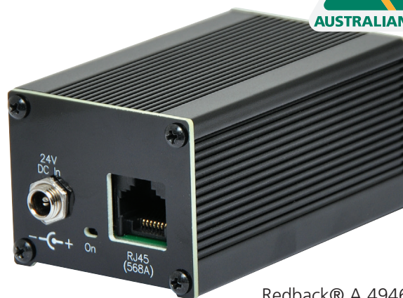
Redback® A 4946 (Rear)