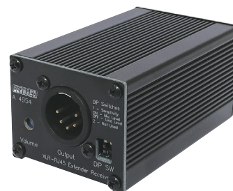
Fig 1. Redback® A 4954 Receiver (Front)

ON - Phantom Power Enabled (15V DC), OFF - Phantom Power Disabled.