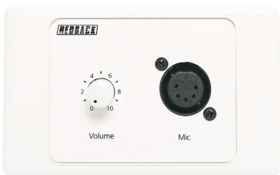
Redback® A 4953 (Front)