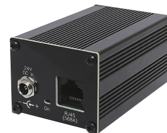
Fig 2. Redback® A 4954 Receiver (Rear)

Failure to follow the correct wiring configuration may result in damage to system components.